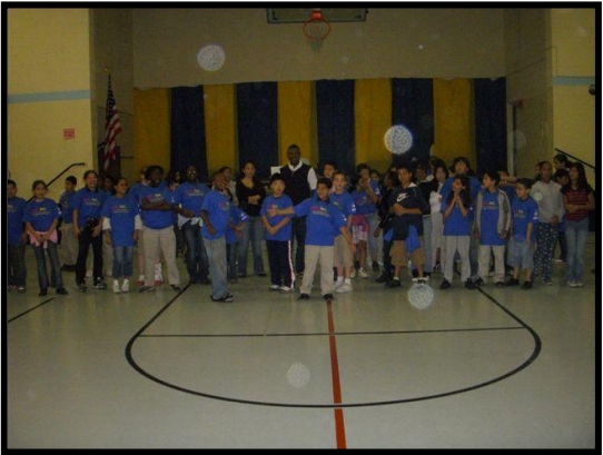
Mark. Set, Go! Students