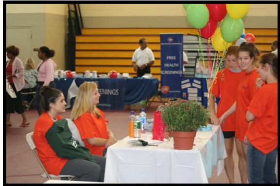
The First Annual Wellness Day