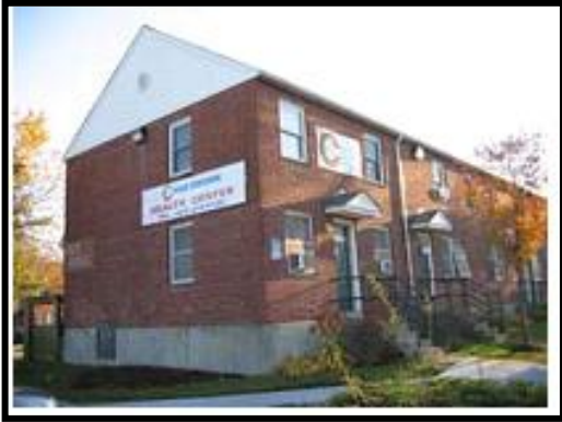
The Chad Brown Health Center